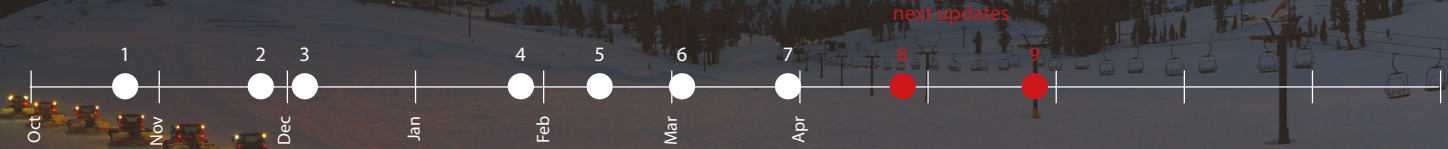
Image: Squaw Valley High Camp - 28 February 2016 - 06:16 - squawalpine.roundshot.com/squaw